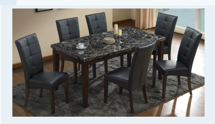
Table & 6 Chairs $850