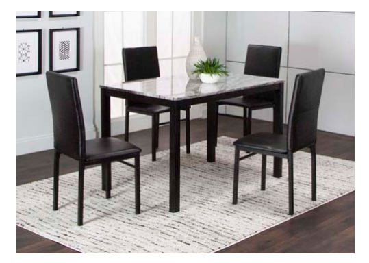
Julie 5 pc Set $299