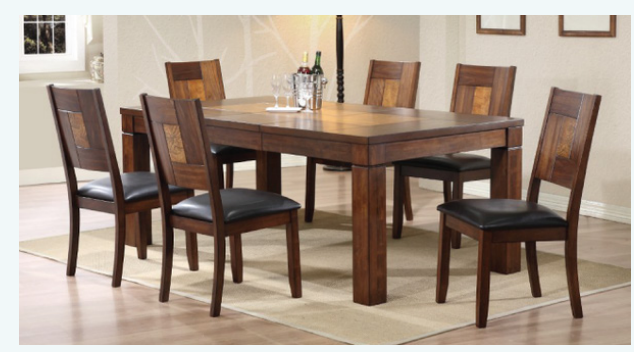
Table & 6 Chairs $1499